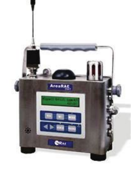
AreaRAE Steel, Inert and Gamma

AreaRAE introduced wireless gas detection and changed the market in fire and hazmat response operations