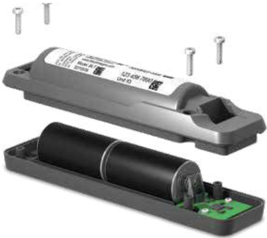
Easy Loner Beacon Battery Replacement